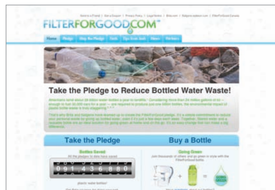
Brita's "Filter For Good" initiative

At a time when Brita was in decline, concerns about bottled water and its impact on the environment provided it with an opportunity to help people make a small change that could make a big difference. Its "Filter For Good" program lets people go online and pledge to reduce the amount of bottled water they drink (and, in turn, decrease the number of plastic bottles). Brita also partnered with NBC's hit show, "The Biggest Loser," and is looking to partner with the Democratic National Convention and other events that want to go bottle-free.