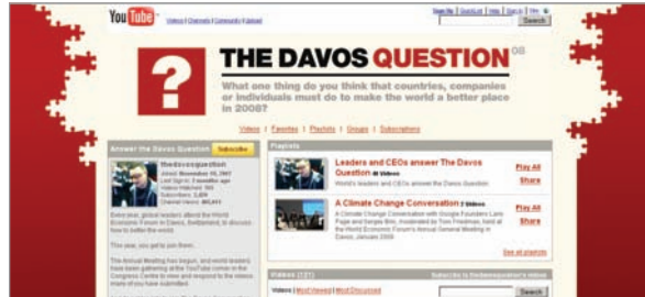
The World Economic Forum's Davos Summit

Given the way the Web works, don't waste time trying to limit where exposure to your content appears. The World Economic Forum (WEF), most known for its Davos Summit, is a great case in point. Yes, it has an official Web site. But its online footprint also includes Flickr, where it posted 800 branded photos; Wikipedia, to which 150 of those photos were uploaded; and YouTube, which contains roughly 640 videos uploaded from Davos that have been viewed 1 million times. The WEF is on Facebook, too, where its group has 819 members and several subgroups, and even on Twitter and BlogTV, where all of its press conferences are shown live.