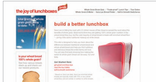
Sara Lee Joy of Lunchboxes campaign

When Sara Lee launched whole-grain white bread and wanted to drive trial, it turned to moms online and the social network CafeMom. There the company launched its Joy of Lunchboxes campaign and got moms to try the healthier bread. More than 28,000 moms participated in the Sara Lee polls about switching breads and the community outreach generated 650,000 impressions.