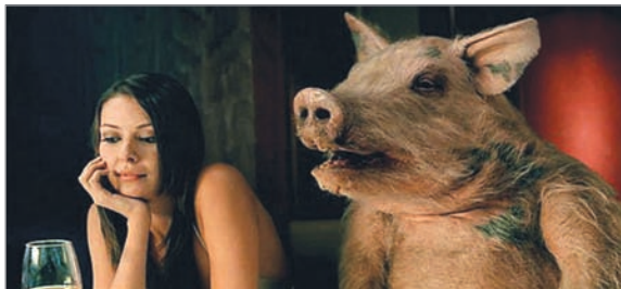
Church and Dwight's Trojan Commercial

Since Church and Dwight’s Trojan brand condom commercials are typically banned from TV, it instead made its ads available online and conducted outreach to online communities. As a result, the ads secured great pick-up on blogs and the Huffington Post and even made it to conservative Fox News.