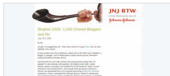
Johnson & Johnson's blog

Once a company starts engaging with online communities, it needs to make sure to stay a part of the conversation or it can backfire. Johnson & Johnson, for instance, showed leadership by adding a blog to its media mix, but has been urged to respond more quickly to issues online. Companies must empower people to make decisions quickly.