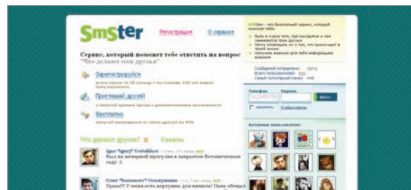
"Smster," the Russian Twitter clone

Since the Internet has no boundaries, at least not physical, companies face challenges of doing country-specific programs. Companies must begin to address the expectations of consumers who can participate, but can't purchase or compete based on the country they live in. In 2007, for example, Edelman in Madrid worked with Canon to promote an event in Spain. The online photography community in Argentina showed interest but also frustration because Canon wasn't offering it there.